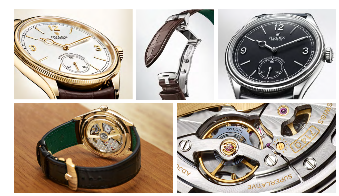
THE NEW FACE OF EXCELLENCE

Elegant, classic and decidedly contemporary, the Perpetual 1908 immortalizes Rolex's age-long daring spirit. Heir to the brand's aesthetic heritage as much as to its numerous innovations in watchmaking, the watch marks a new milestone in the brand's pursuit of excellence. This fine example of Rolex's watchmaking prowess, with Superlative Chronometer certification, brings classicism to the future.