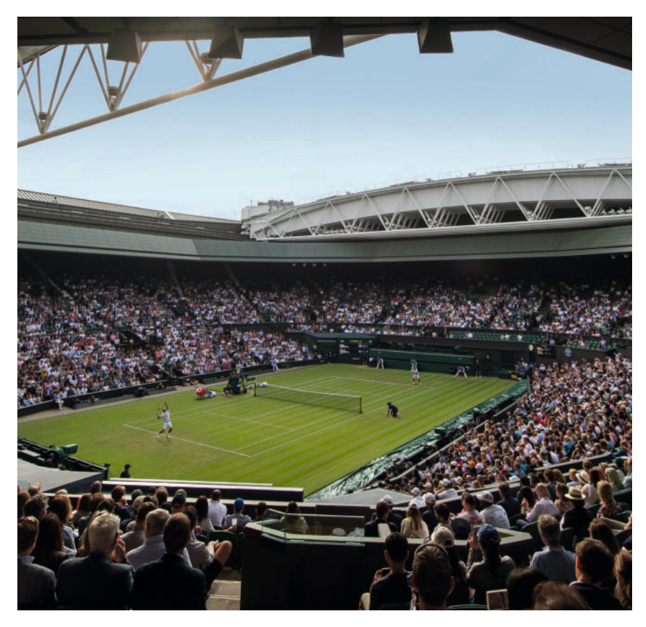
The 2022 edition of The Championships, Wimbledon, marks the centenary of Centre Court at its current home in the Church Road grounds.

This unprecedented level of sporting excellence struck a chord with the values intrinsic to Rolex. A natural partnership developed at all the major tennis events, now spanning almost 45 years.