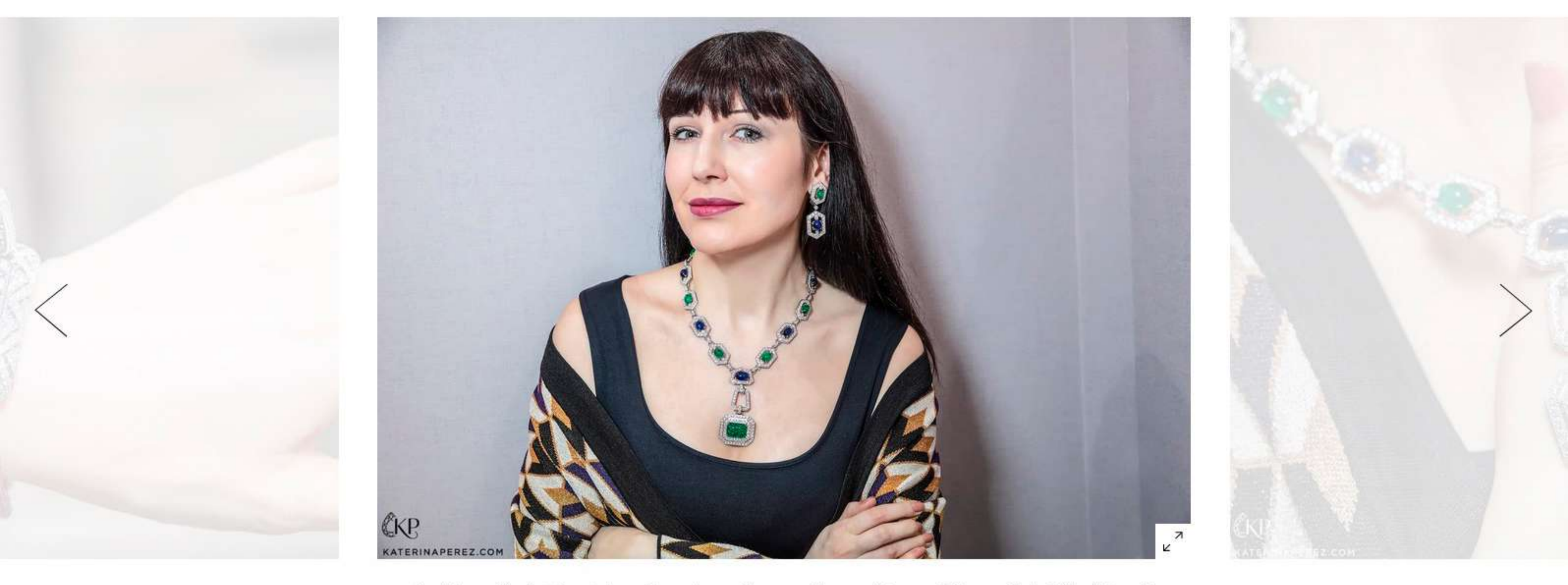
1 of 4 • Veschetti sautoir and earrings with emeralds, sapphires and diamonds in 18k white gold

The 'Ortensia' line would not be complete without complementing ring and earrings that perfectly complement the centerpiece necklace. Created to accent the pink and purple shades within the necklace, the earrings are decorated with 1.38 carats of oval kunzites, and the ring is decorated with an elegant 7.81 carats cushion cut tanzanite. “The tradition at Veschetti is to cut all of our core stones from the same rough form in order to use colors which are a perfect match. This approach also gives us the freedom to cut the shapes and sizes that we want for our designs,” Head of Jewellery Production Marco Veschetti tells me.