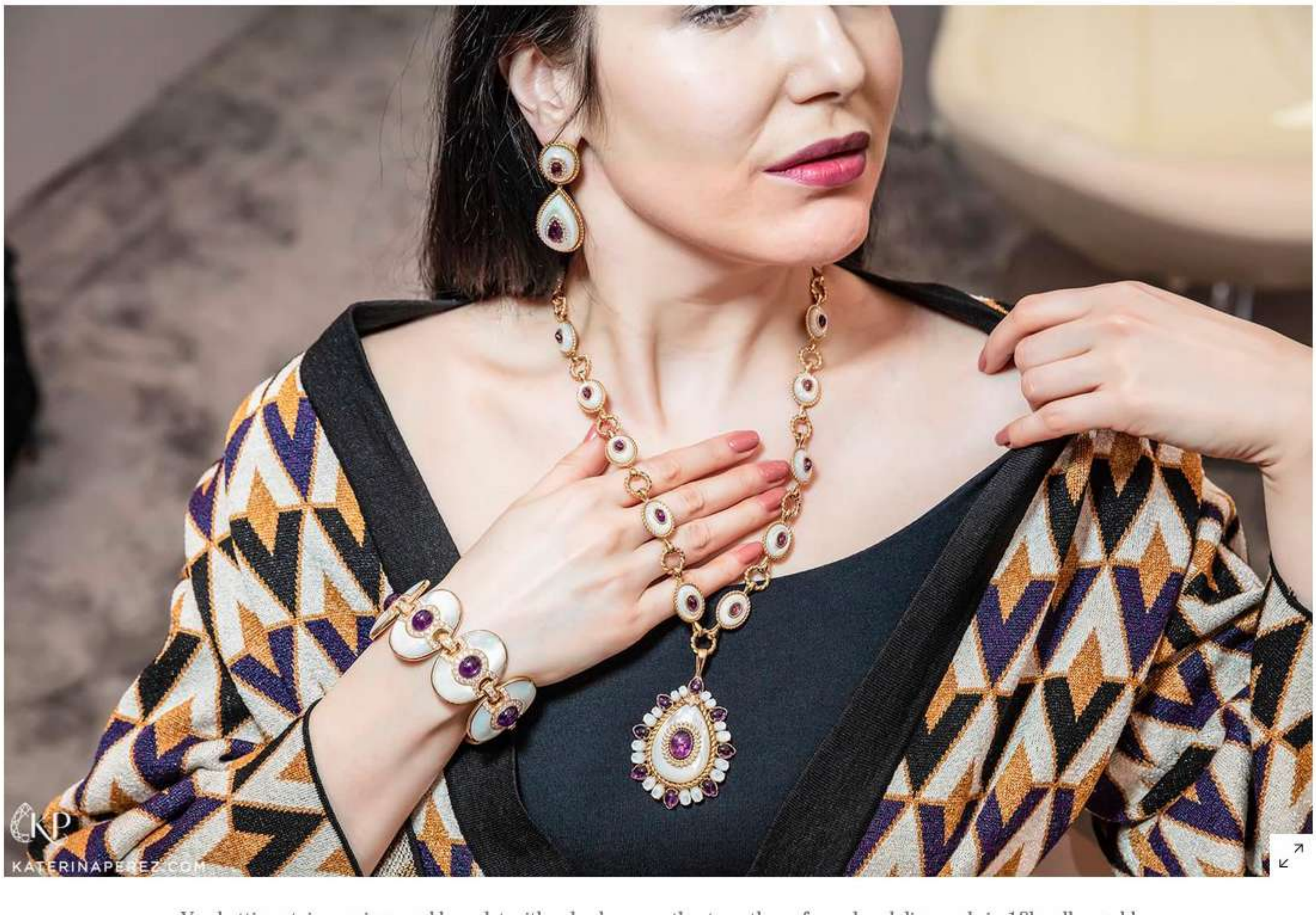
Veschetti sautoir, earrings and bracelet with cabochon amethyst, mother-of-pearl and diamonds in 18k yellow gold