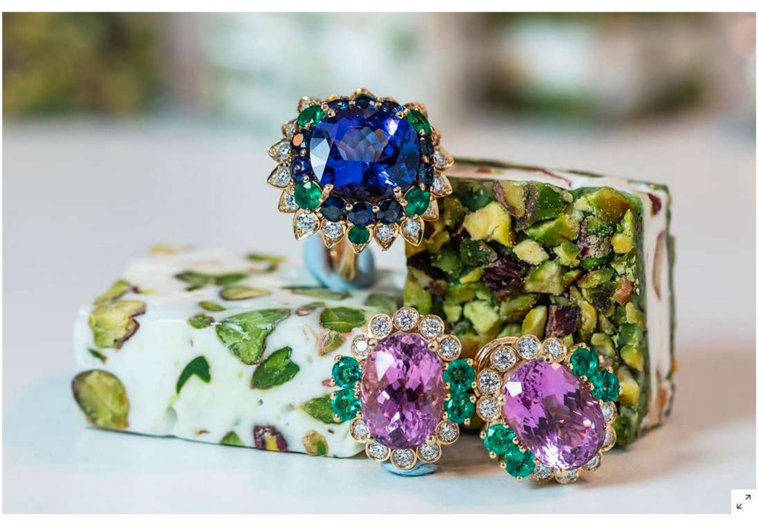
Veschetti 'Ortensia' ring with 7.81ct cushion cut tanzanite, emeralds and diamonds, and earrings with 1.38ct oval kunzites, emeralds and diamonds, both in 18k yellow gold

“Although most our pieces feature deeply saturated colours like the green of emeralds, the blue of sapphires, the red of rubies as well as the strong colours of semi-precious and opaque stones, the new 'Ortensia' necklace is subtler in its hues. Here, we were inspired to adopt a more natural, muted palette with delicate, attractive colours,” says Laura Veschetti.