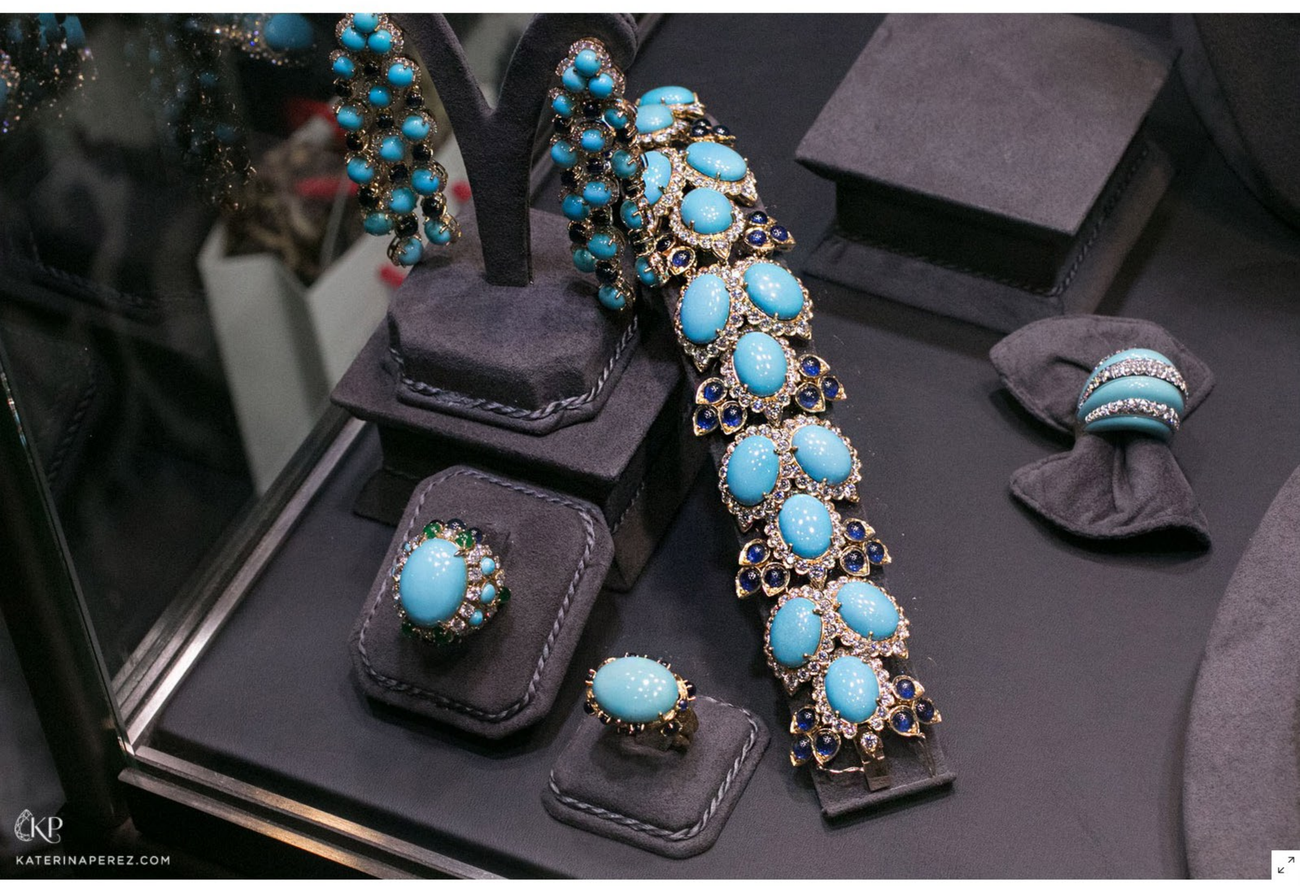
Veschetti 'Vera' bracelet, earrings and rings featuring turquoise, sapphires, emeralds and diamonds

And it's true: bright shades and bold combinations of tones are what makes the Italian brand's luxury jewellery simply unforgettable. However, in addition to the vibrant colour scheme, the Veschetti jewellery intrigued guests with the unique jewellery techniques which had been used to produce these pieces. For example, according to Laura, the most popular rings were the pieces with colourless or yellow diamonds inlaid within a gold casing, which is hidden under a 'shell' of turquoise, coral, mother-of-pearl or wood.