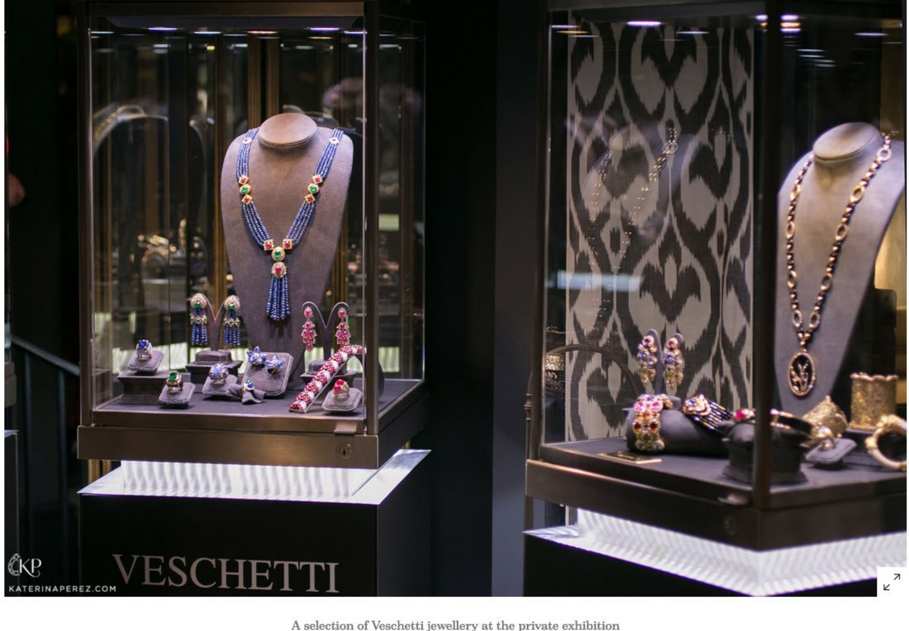
A selection of Veschetti jewellery at the private exhibition