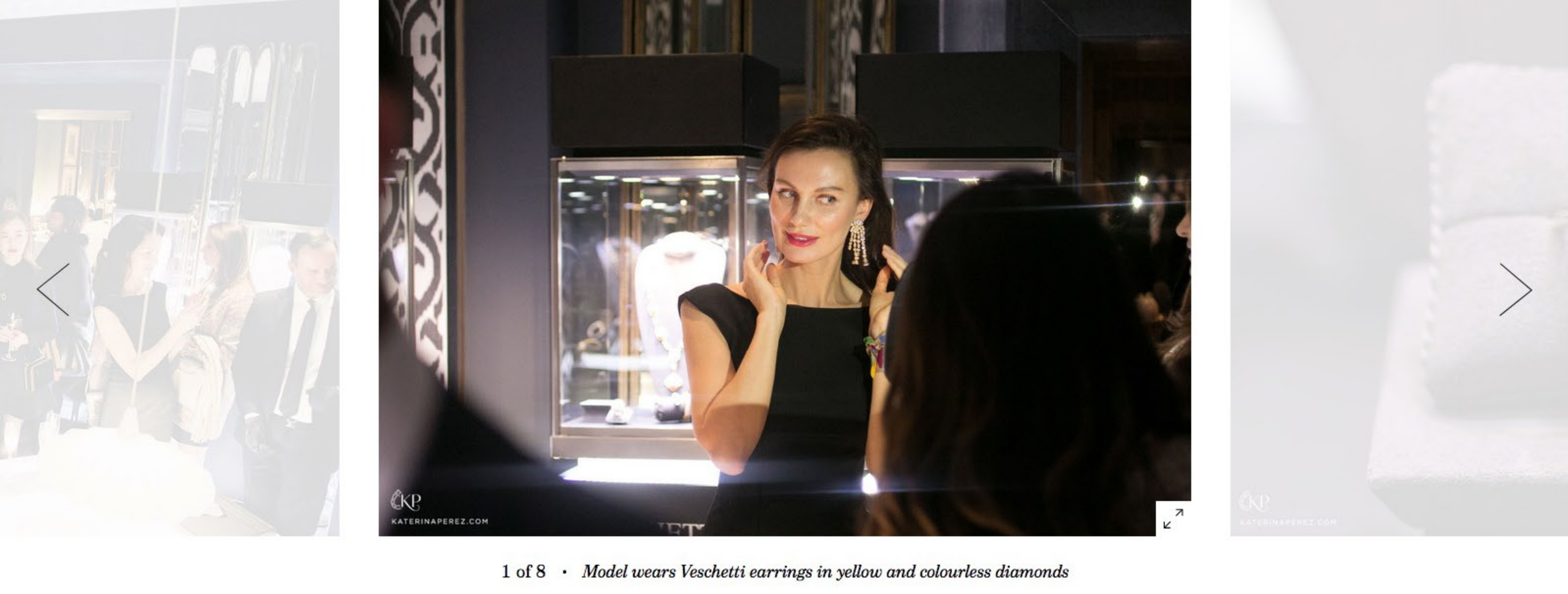
1 of 8 · Model wears Veschetti earrings in yellow and colourless diamonds