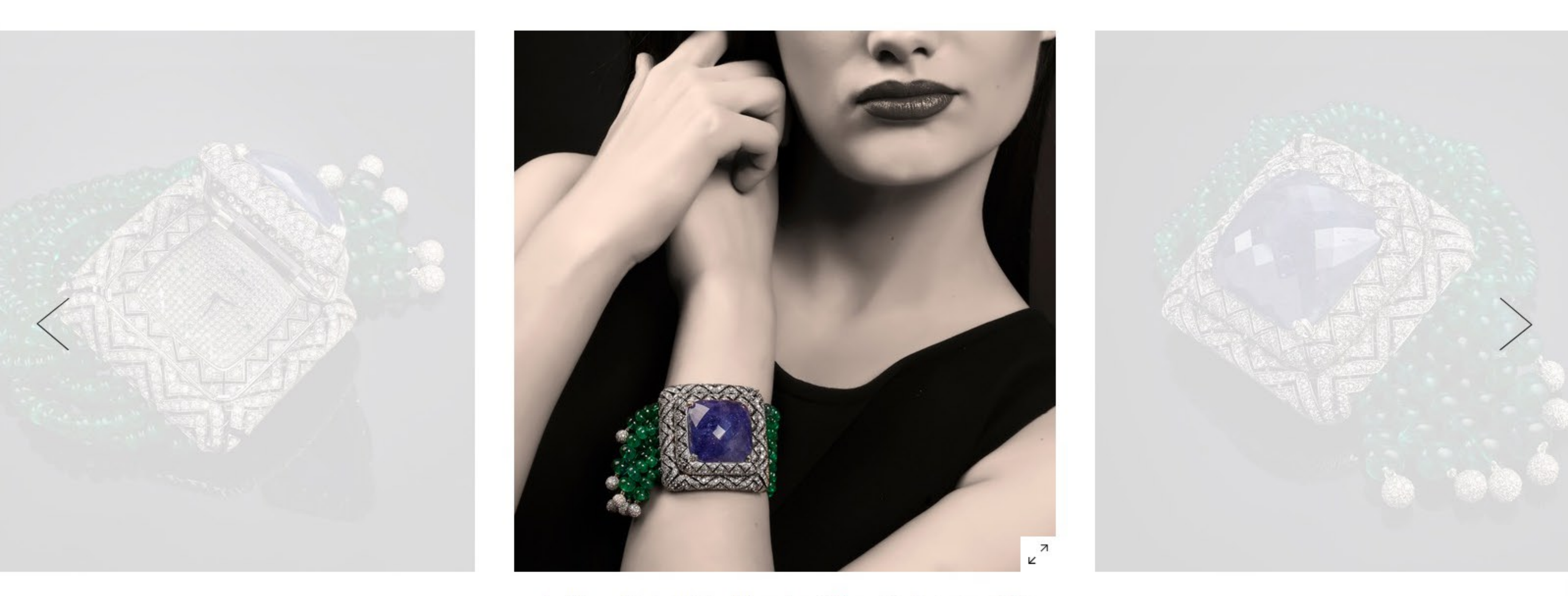
1 of 3 · Veschetti 'Royal Green' watch bracelet, featuring a 89ct Tanzanite, 335ct Zambian Emeralds and diamonds from Veschetti Collection

The watch's bezel features a double zig zag pattern set with colourless diamonds, and an interesting design solution was engineered for the bracelet of the watch, which is made of emerald beads weighing a total of 335.5 carats. These high-quality beryls were mined in Zambia, and are therefore especially valuable stones.